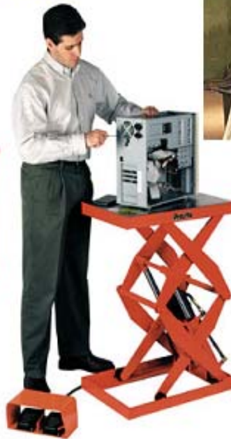
Double Lift Table