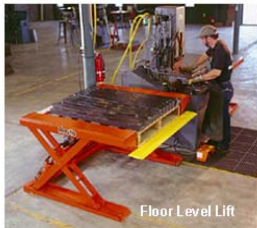
Floor Level Lift