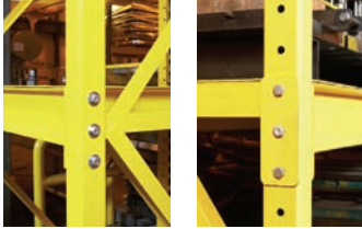
Position drilled 3" adjustability

Steel King Die Storage Racks are designed to meet the most demanding requirements. Standard die storage racks feature: