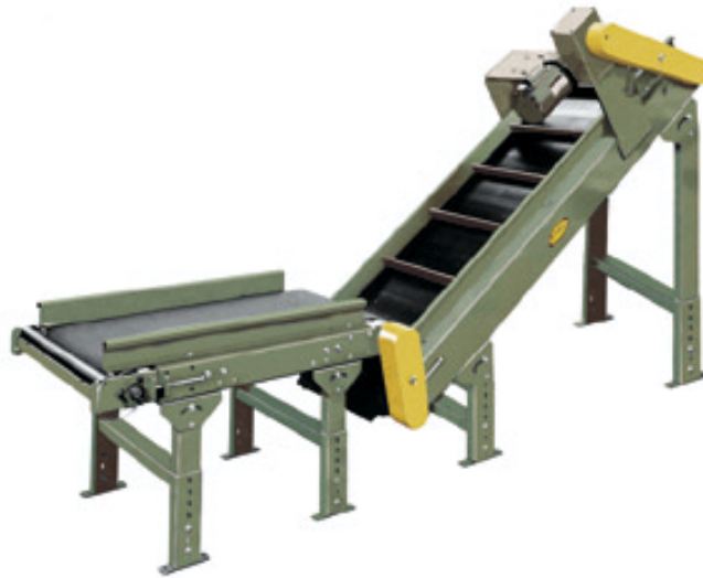
FEEDER SHOWN WITH OPTIONAL PC TYPE GUARD RAIL, GRAVITY BRACKET WITH POP-OUT ROLLER AND MS TYPE FLOOR SUPPORTS

CAPACITY —300 lbs. total distributed load at 65 FPM.