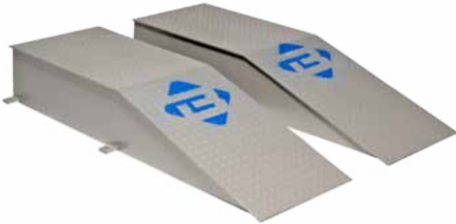
STEEL WHEEL RISER