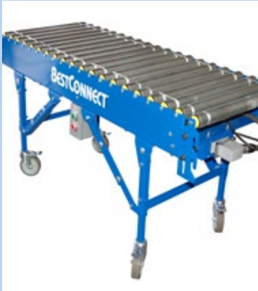
5' Straight Section