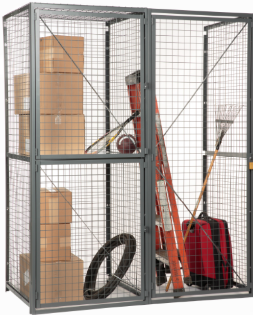
Double Tier Starter Unit with Single Tier Add-on Unit shown.