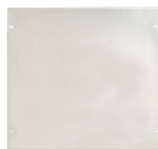
Sheet metal bottom shelf option