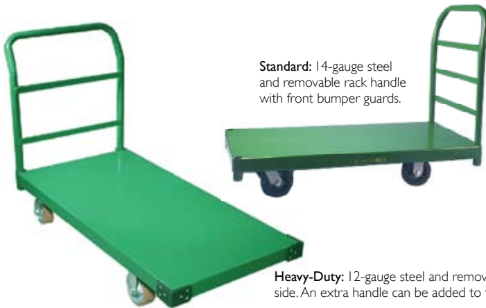
Standard: 14-gauge steel and removable rack handle with front bumper guards.

Heavy-duty steel platform trucks are reinforced with steel cross-battens to evenly distribute loads of up to 2,000 pounds. Platform edges have been rounded to reduce damage to doorways, walls, nicks, and cuts. Platform is mounted on 2 rigid casters and 2 swivel casters with 6" x 2" wheels. Casters are securely bolted onto extra caster top plates which are then welded to the underside of the platform for high-strength applications.