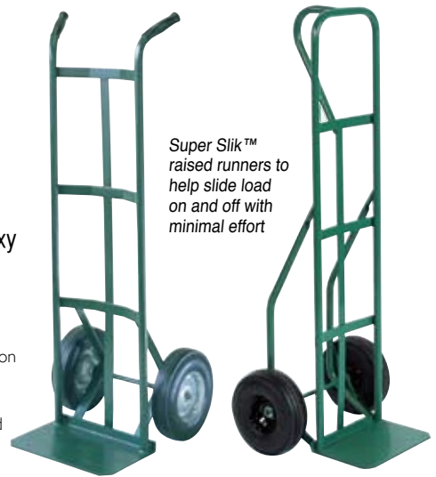
Super Slik™ raised runners to help slide load on and off with minimal effort

HANDLES: Continuous loop handle lets you decide the best place for your hands on the truck. Push or pull style for excellent mobility with one or two hands. Loop permits easier "breaking" of the load and acts as leg when truck is placed horizontally for loading. Dual grip handle provides rubber grippers with preformed finger indentions for a firm load hold.