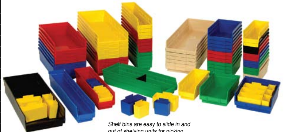
Shelf bins are easy to slide in and out of shelving units for picking and assembly.