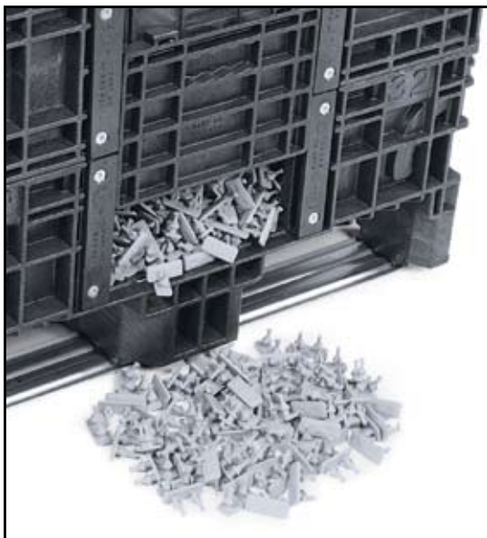
Above: gravity feed models available. Please contact us for more information. Many options and sizes can be matched to your applications.