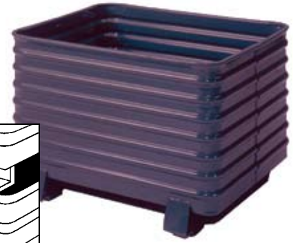
Formed, 1/4" stacking legs allow easy, safe container stacking.