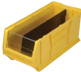
Optional dividers and clear fronts increase bin functionality