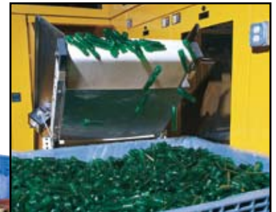
Above: Conveyor feeding bulk parts into shipping bulk box.