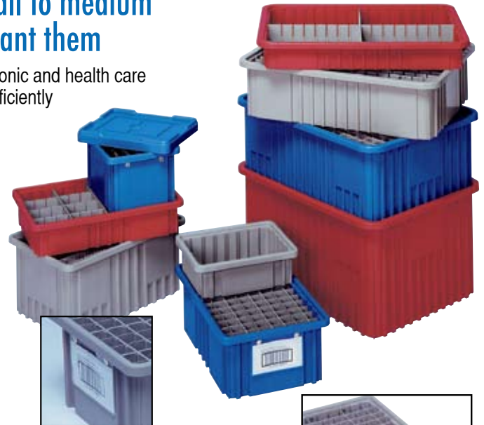
LEFT: Transparent and opaque container lids help protect stored items. RIGHT: Divide containers the way you want to with long & short dividers. ABOVE: Clear label holder snaps on to any size container.