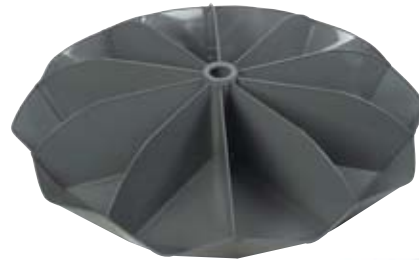
10 compartments 58" & 44" Rotabins