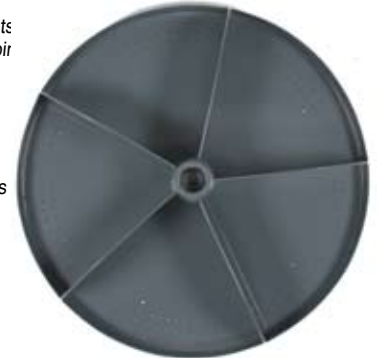
5 compartments; 44" & 34" Rotabins