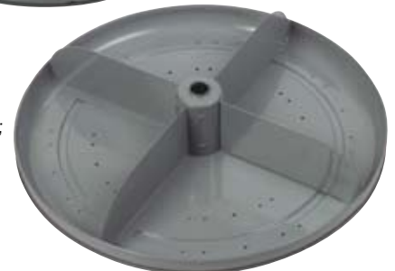
4 compartments; 17" Rotabins