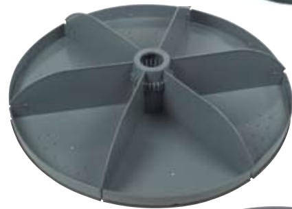
6 compartments; 28" Rotabins