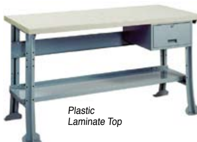
Plastic Laminate Top

These rock-solid benches are used in assembly operations, mechanical, manufacturing, and shop operations.