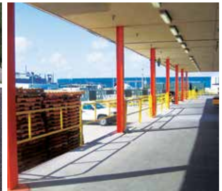
INDUSTRIAL PLANT SAFETY