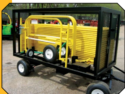
Goliath Mega Cart