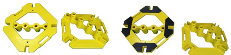
Base-without pads Mount up to four rails