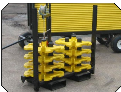
Goliath Base Storage