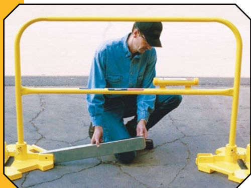
Adjustable Toe Boards