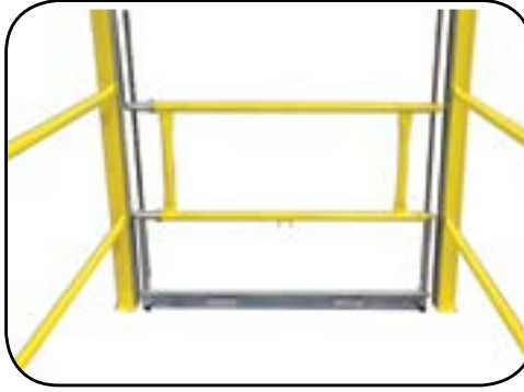
Integrated toe-board on leading edge gate.