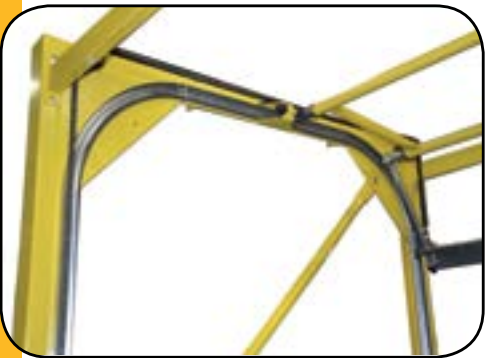
Zinc plated tracks and hardware