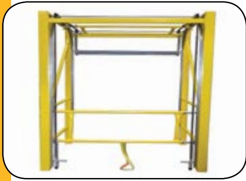
1. Gate closed on inboard side. Gate open on leading edge side. Place pallet into receiving area.