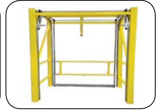
3. As inboard gate fully opens, leading edge gate is fully closed maintaining fall compliance.