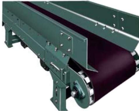
DETAIL VIEW OF SELF-CLEANING TAIL PULLEY