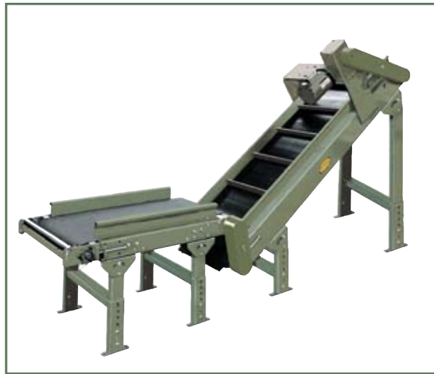
FEEDER SHOWN WITH STANDARD PC TYPE GUARD RAIL, GRAVITY BRACKET WITH POP-OUT ROLLER AND OPTIONAL MS TYPE FLOOR SUPPORTS

CAPACITY —300 lbs. total distributed load at 65 FPM.