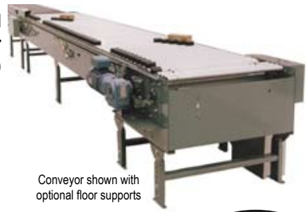
Conveyor shown with optional floor supports

High Speed Sortation Conveyor (Small Item)