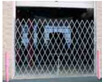
Single Folding Gates