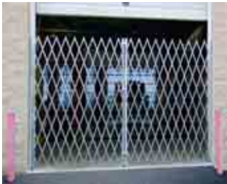
Pair Folding Gates