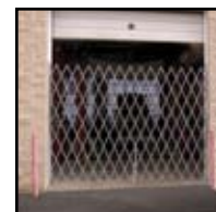
(Single Folding Gates)