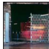
(Pair Folding Gates)