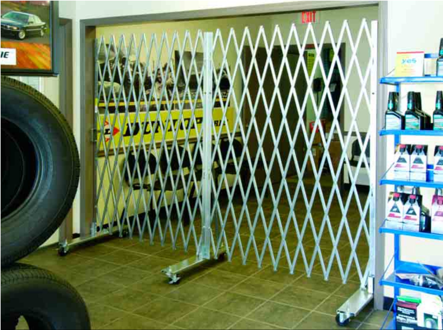
Moveable Access Control and Security Rolls Out of Sight When Not in Use