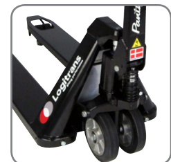
Panther Silent has permanent quick lift.