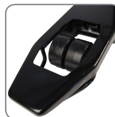
With twin fork wheels it is very easy to change direction.