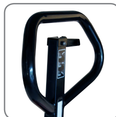
Ergonomic handle ensures the user a relaxed hold.