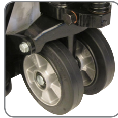
The special rubber wheels are gentle to floor and flagstone layer.