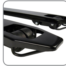
The hoop skates on the forks ensure an easy fork insertion and withdrawal in/out of pallets.