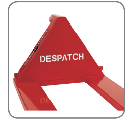
Name, logo or another text can be cut out in the A-frame or a special colour can be chosen.