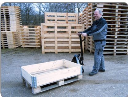
Panther Silent also manages outdoor transport. Metallic chips, small stones and snow do not get stuck to the wheels.