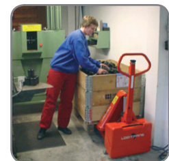
Patented cylinder construction gives low overall height.