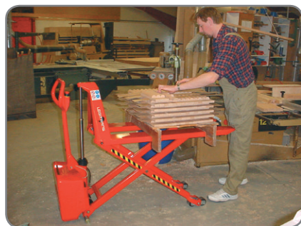
Optional extras: remote control, level control and brake.