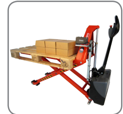
Level control (optional extra) ensures a constant working height.