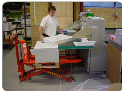
The manual Thork-Lift needs very low power for the pump function and has foot protection and neutral position.