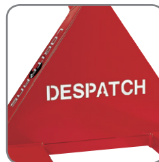
Can be marked with name/department.