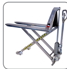
Available as manual, electric and stainless.