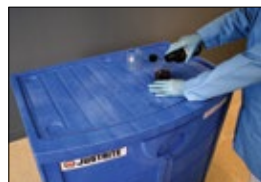
Handy work surface