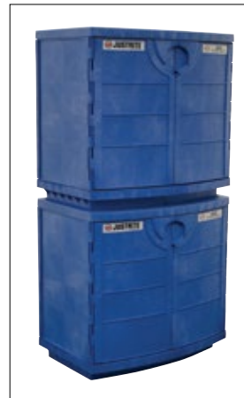
Stack two cabinets for increased storage capacity.