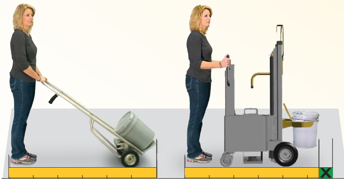
Works in the same operating space as a two-wheel truck.