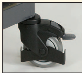
Swivel casters with toe guards