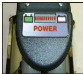
Battery status indicator