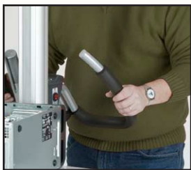
Comfortable padded grip handle