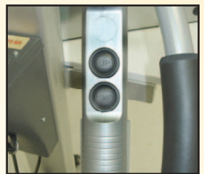
Two-button remote lift control