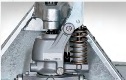
Chromated pump pistons and low temperature hydraulic oil