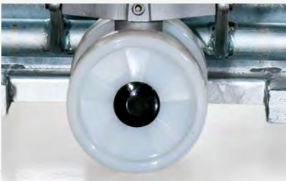
Non-marking white nylon wheels and rollers