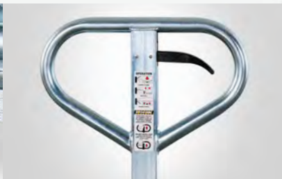
Electro-galvanized pump handle