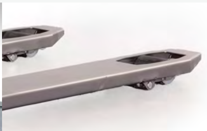
Hot dip galvanized fork frame