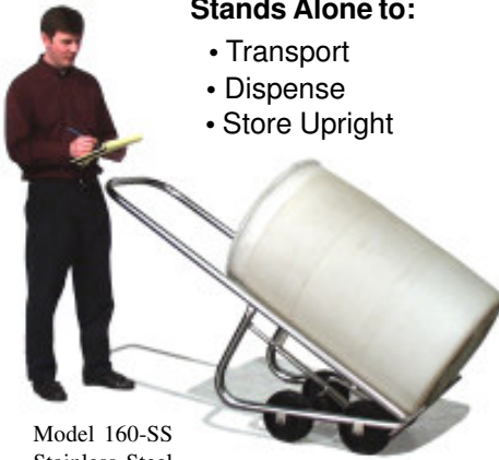
Model 160-SS Stainless Steel