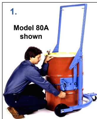
1. Model 80A shown

Morse drum handlers normally have steel structure, but spark resistant models are made with Monel drum band. The letter "M" in model 80AM designates the unit is made with spark resistant parts. Stainless steel cinch chain replaces the standard steel chain.