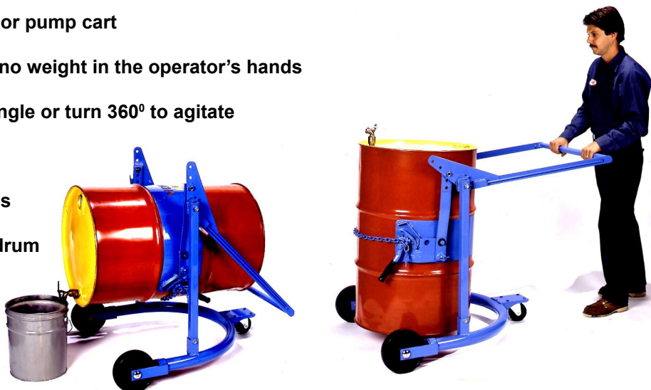
Model 80A shown