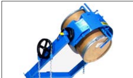
Hydra-Lift Karrier with Model 55/30-16