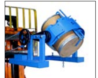
Forklift-Karrier with 55/30-16