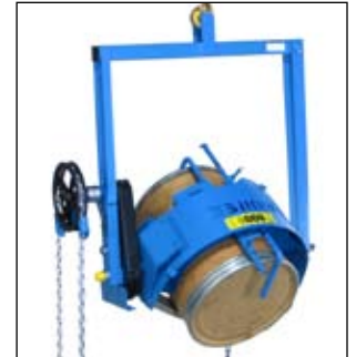
Kontrol-Karrier with Model 55/30-16

Insert the correct size Diameter Adaptor to handle your smaller drum. Diameter Adaptors are available for sizes from 14" to 22" diameter. They are available to fit below-hook Kontrol-Karriers, as shown here, Forklift-Karriers, Hydra-Lift Karriers, and Vertical-Lift Drum Pourers.