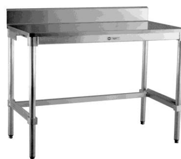
Stainless Steel Top with Backsplash