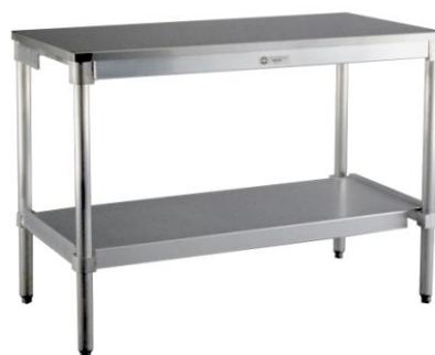
Stainless Steel Top with Undershef

These tables carry a Lifetime Guarantee against rust and corrosion and also carry a Five-Year Guarantee against workmanship and material defects.