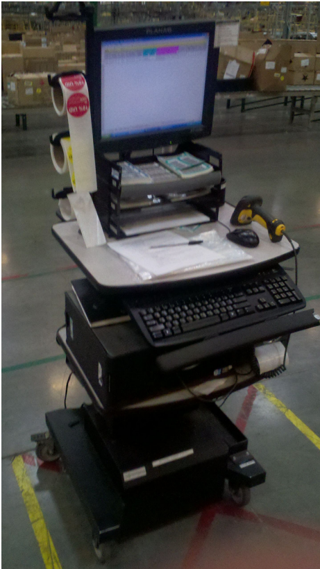
NB440 Mobile Powered Workstation with Desktop PC, LCD, Label Printer & Scanner

Customer: Ross Stores, Inc., an S&P 500, Fortune 500 and Nasdaq 100 (ROST) company headquartered in Pleasanton, California, is the nation's second largest off-price retailer with fiscal 2010 revenues of $7.9 billion.