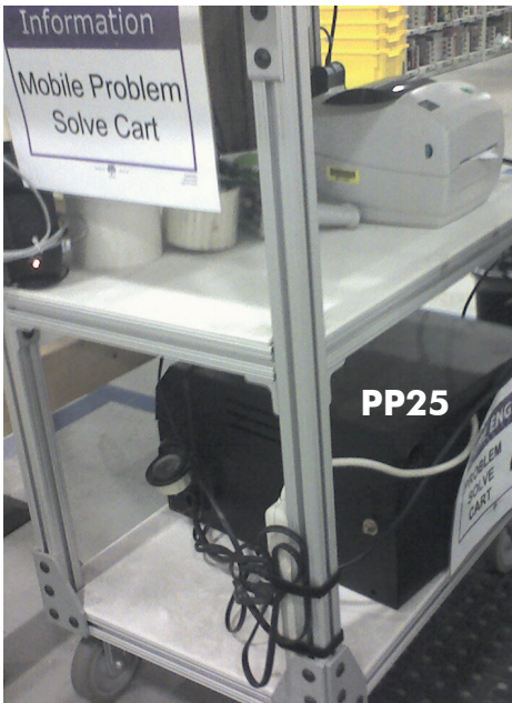
PP25 Stand Alone Power Package shown on bottom of cart

Customer: Amazon.com is a multinational electronic commerce company headquartered in Seattle, Washington and is the world’s largest online retailer. Originally started as an on-line bookstore, Amazon has diversified immensely. They have over 20 fulfillment centers throughout the US, concentrated heavily in PA, KY and AZ. The facilities range from 880K to 1.2 million square feet.