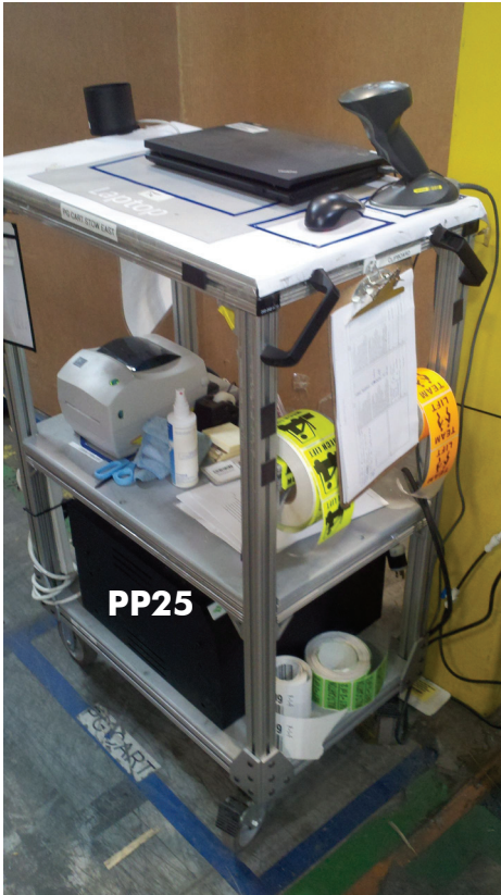
Mobile Problem Solve Cart

Designed by Amazon. Powered by Newcastle Systems.