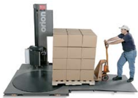
Orion Flex Series stretch wrapping machines set the standard for high performance, value and efficiency. Available in both rotary tower and turntable styles, Flex machines are available in both semi-automatic and portable automatic models.