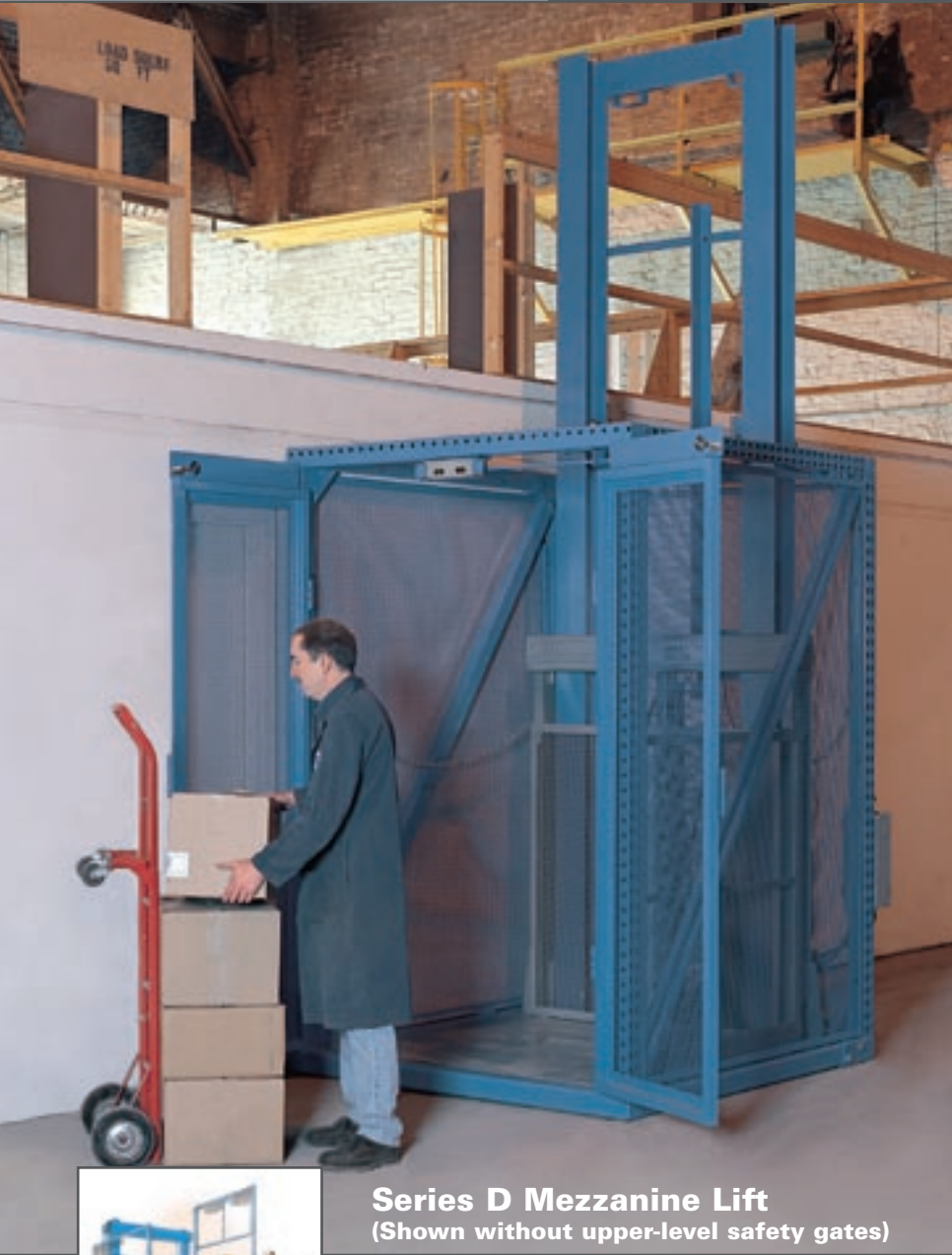
Series D Mezzanine Lift (Shown without upper-level safety gates)

As an option, the Pflow Series D Lift can be shipped as a self-contained unit equipped to service in-plant mezzanines. The Pflow Series D Mezzanine Lift is pre-assembled and shipped with lower-level enclosures and code-approved safety gates. The lift motor pump and controls are pre-wired for fast, easy, one-day installation.