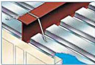
Dust Cover Support Beam

The ceiling system hangs approximately 6" from the dust cover providing a plenum for electrical wiring and light fixtures. It consists of a pre painted metal grid with lay-in acoustical ceiling tiles made from class A non-combustible white fissured mineral board. Standard ceiling tiles are 2' x 4', but custom ceilings are available.