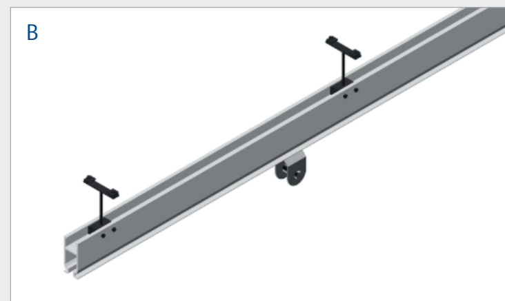
A. Aluminum bridge on ceiling mounted aluminum runway