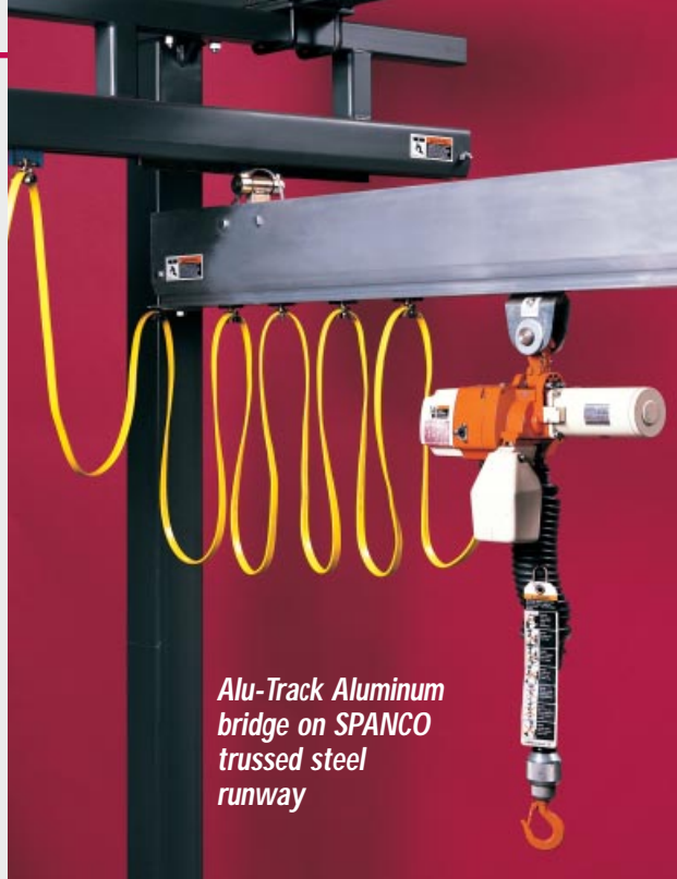
Alu-Track Aluminum bridge on SPANCO trussed steel runway