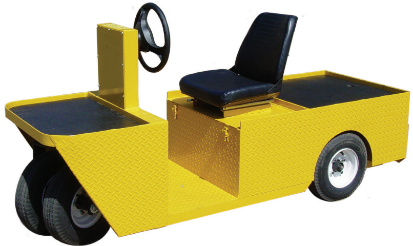
MV 500 Shown with optional equipment

Industrial environments demand a special kind of equipment. That's why Wesley International's electric vehicles are meticulously engineered for safety, reliability and low maintenance. From the dual front wheels to the sealed motor, Wesley's stock chasers offer increased stability and reduced down time. As a result, our Pack Mule stock chasers have been the choice of discerning buyers for years. They know that increased productivity and reduced maintenance costs deliver greater profit.