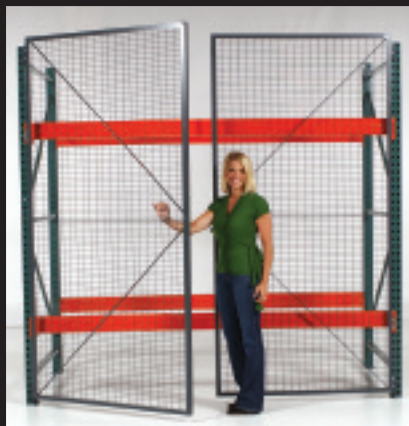
Hinged doors for rack enclosure

6208 Strawberry Lane Louisville, KY 40214 800-626-1816 www.wirecrafters.com