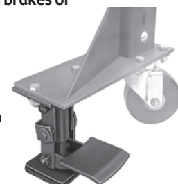
Caster shown with optional Floor Lock.