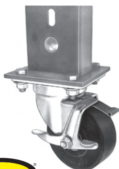
Caster shown with optional Brake. Available with Swivel Caster only. 4 in. Caster shown.

NOTE: Casters can limit overall capacity of conveyor.