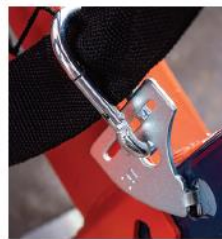
Optional assembly carabiner hardware