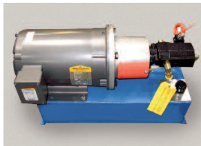
▶ Power Unit