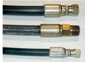
▶ Double Wire Braid Hose