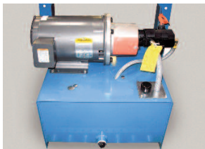
▶ Power Unit