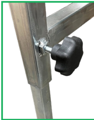
Adjustable leg height