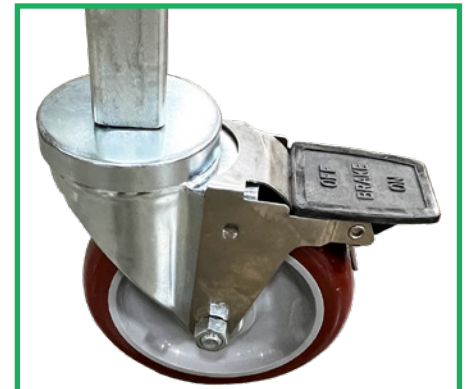
Locking 5" casters on both ends