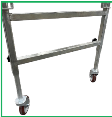
Legs constructed of two welded crossbraces for durability and longevity