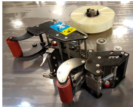
Tape Head Assembly