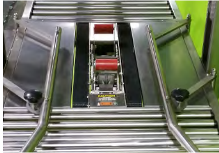
Stainless Steel Table