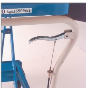
Convenient Hand-Lever Lowering Control For Model BX