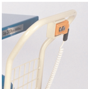
Removable Pendant Push-Button Control in Handle Mount (BXB)