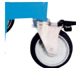
Locking foot brake is standard.