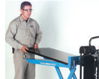
Accessory tables mount on top of the forks.