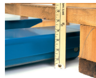
Forks lower to 3.3 in. for optimal clearance under skids.