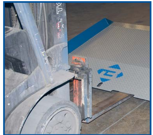
Speedy Board® option also available

Manufactured and tested in compliance with ANSI Standard MH30.2