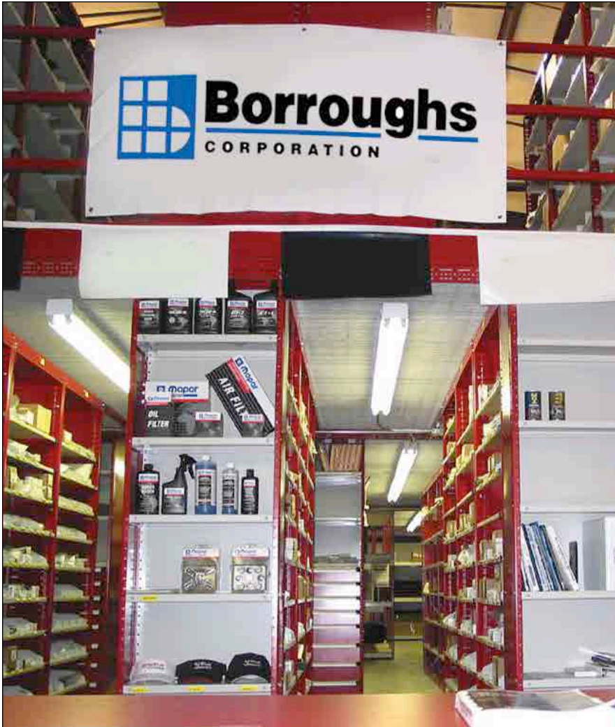
Originally designed for automotive parts departments, Flexi-Bins are sturdy enough to support a second level.