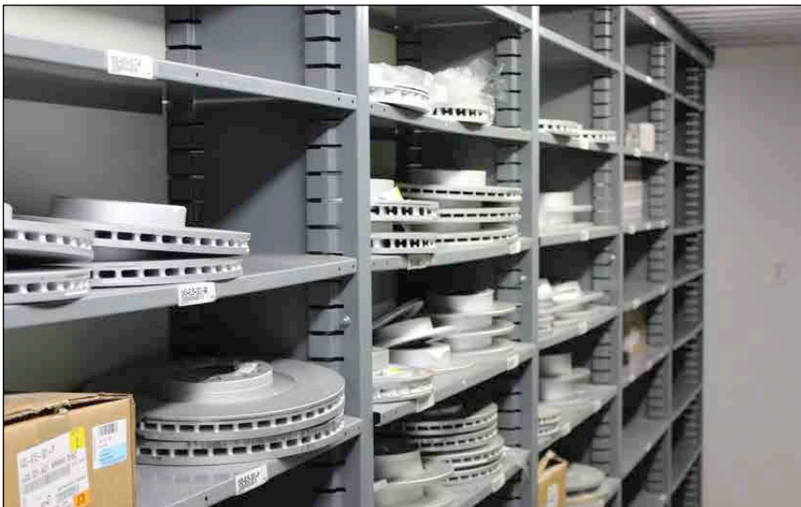
Flex-Bins shelving capacity of 150 lbs. per shelf allows for great versatility in the products that can be stored on these systems.