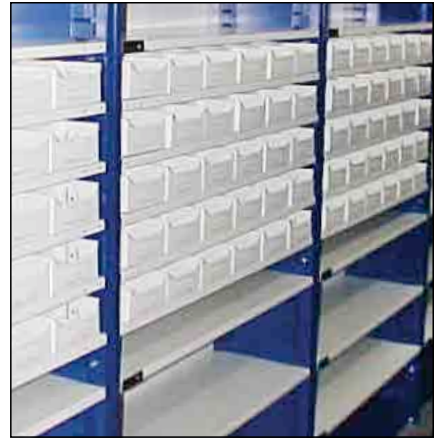
Available Flexi-Bin drawers (dividers optional) are equipped with a backstop that prevents accidental removal.