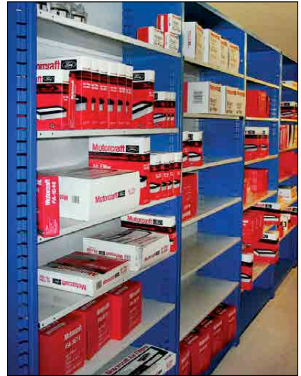
Automotive parts are stored properly in Flexi-Bins, catalog #FB101.