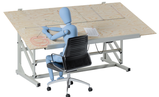
Sitting Tilt Position