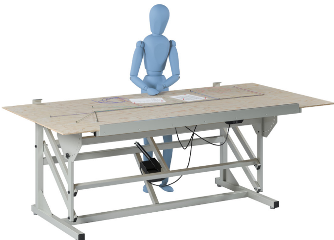
Standing Horizontal Position