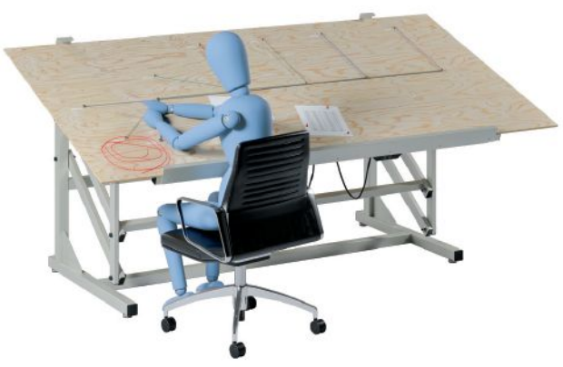
Sitting tilt position