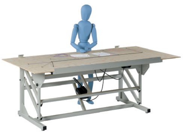
Standing horizontal position

BOSTONtec focuses on providing quality, ergonomic workstations and accessories that are designed to increase productivity and improve quality of work life. With more than 20 years of design and manufacturing experience, the company is a leader in modular workstations and customizable designs to meet the specific requirements of fulfillment, assembly, medical and other light-duty applications.