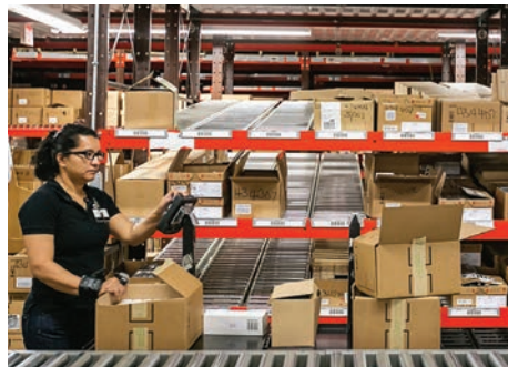
Carton Flow: for picking & assembly. www.cisco-eagle.com/cartonflow