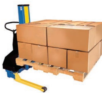
Lifts: scissor type, cranes, hoists, VRCs. www.cisco-eagle.com/lifts