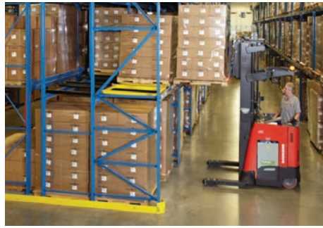
Racks and rack systems: including pallet rack, cantilever racks, die and tool storage, roll-out and other high-density storage solutions. www.cisco-eagle.com/racks