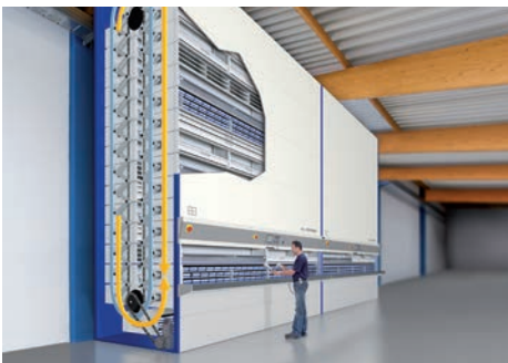
Carousels: high-density order picking. www.cisco-eagle.com/carousels