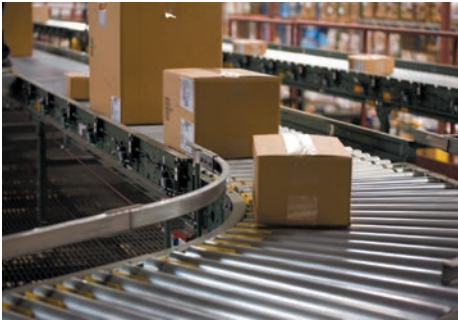
Conveyors: all types of systems. www.cisco-eagle.com/conveyors