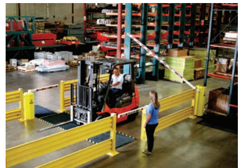
Safety: equipment & systems. www.cisco-eagle.com/safety