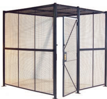
Partitions & gates: for plant security. www.cisco-eagle.com/security