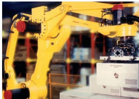
Robotics: picking, palletizing & more. www.cisco-eagle.com/robotics