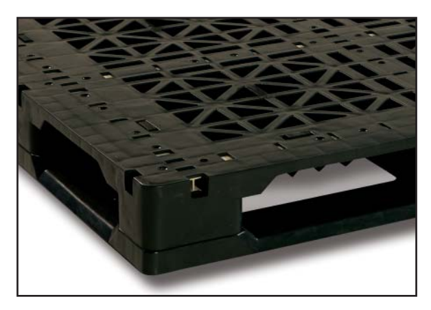
Optional reinforcing rods allow Decade pallets to handle static loads up to 50,000 lbs.